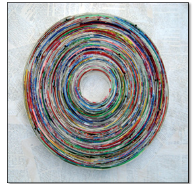
#1 record is 24x24 and is made out of old law books, Starbucks cups, origami paper, candy packaging, and construction paper.

For more information visit www.TESLAW.org